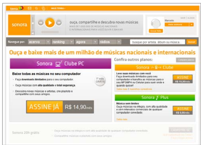
Sonora's subscription page, offering both free and paid subscription options

The service was integrated with all of Terra's pre-existing portal services, including billing, advertising inventory management, content publishing (for other portal areas) and Web analytics. Terra now has complete visibility and control over Sonora's business and technical performance indicators, including audience, sales revenue, advertising revenue, traffic and user behavior.